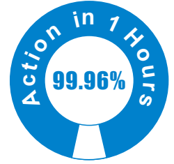
Reduction in Staphylococcus albus