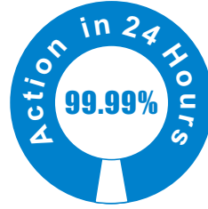
Reduction in Aspergillus niger