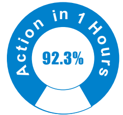
Reduction in Air natural bacteria