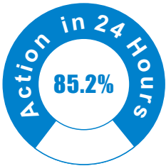
Reduction in Hydrogen sulfide 30m 3 Test chambe