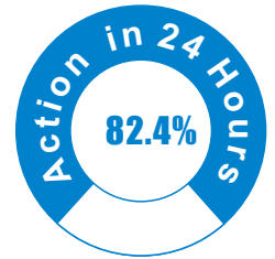
Reduction in Formaldehyde 30m 3 Test chambe