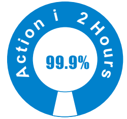
Reduction in H1N1&EV71