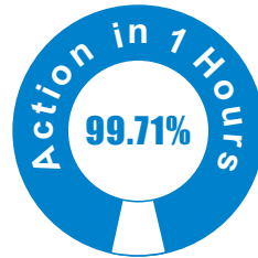
Reduction in PM2.5 30m 3 Test chambe