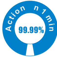
Reduction in ASFV