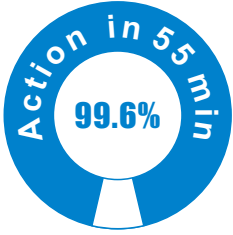
Reduction in Escherichia coli Source:TUV-721668492