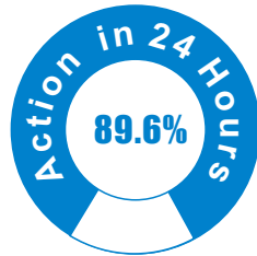
Reduction in Ammonia 30m 3 Test chambe