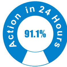
Reduction in TVOC 30m 3 Test chambe