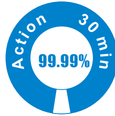
Reduction in HCoV-229E