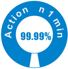
Reduction in GX-P2V

Independently Tested and Verified Under Real World Conditions