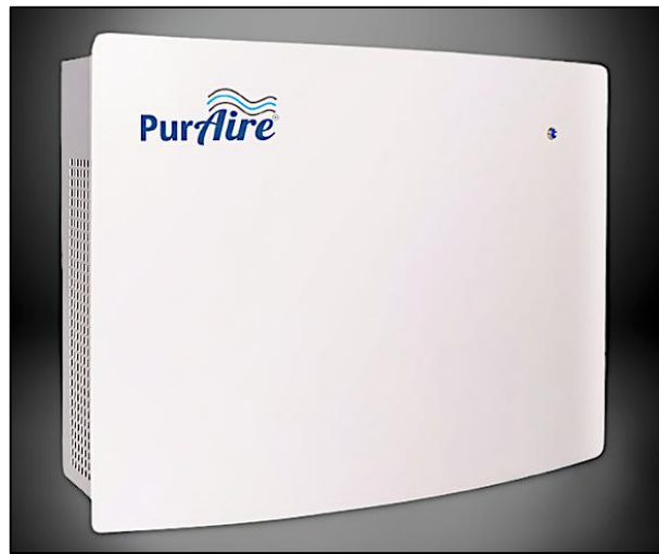
MiniPro-2 Treatment Area 50-80 SqM

The PurAire MiniPro 1 & 2 are designed to eliminate Odours, Viruses like COVID-19, and even Tobacco smells floating in the air in your toilets, hotel guest rooms, clinic, or any other space of up to 80 SqM.