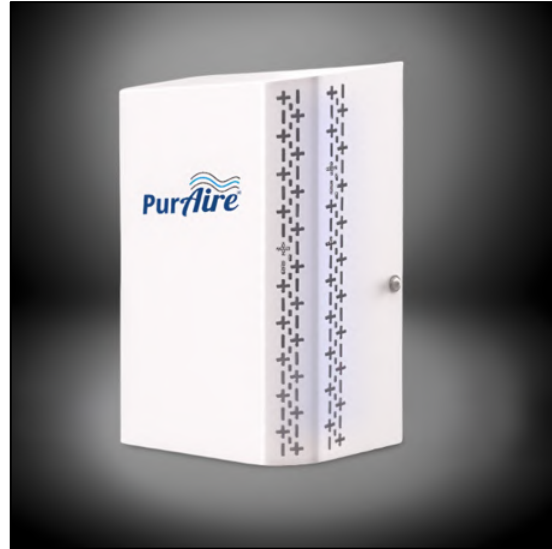
MiniPro-1 Treatment Area 20-40 SqM